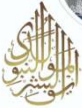
Prophet's Birthday God Bless Muhammad, Peace Be Upon Him